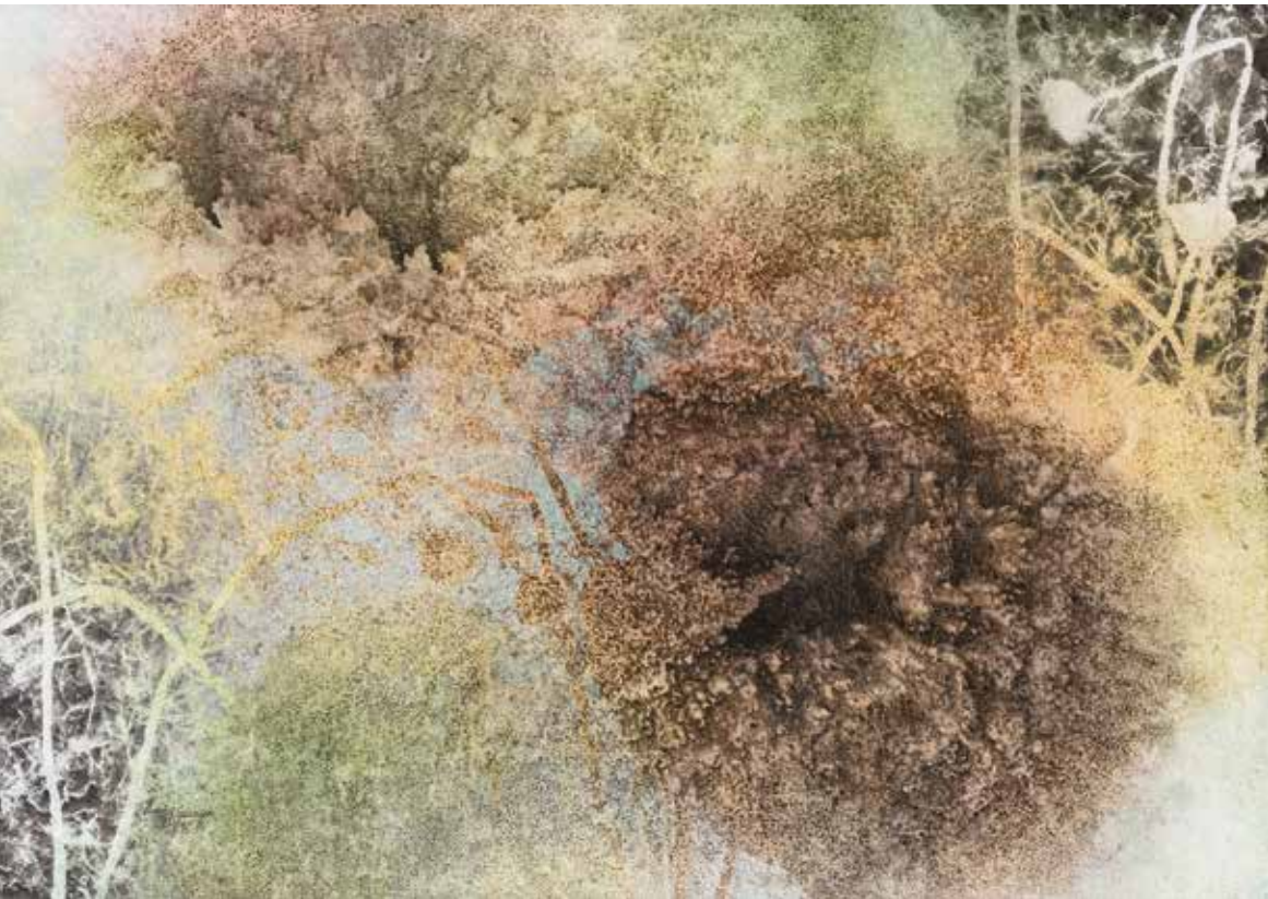
Lotus in Dream 荷夢

Oil and Mixed Media on Canvas 麻布、油彩、綜合材料 140 cm x 200 cm 2014