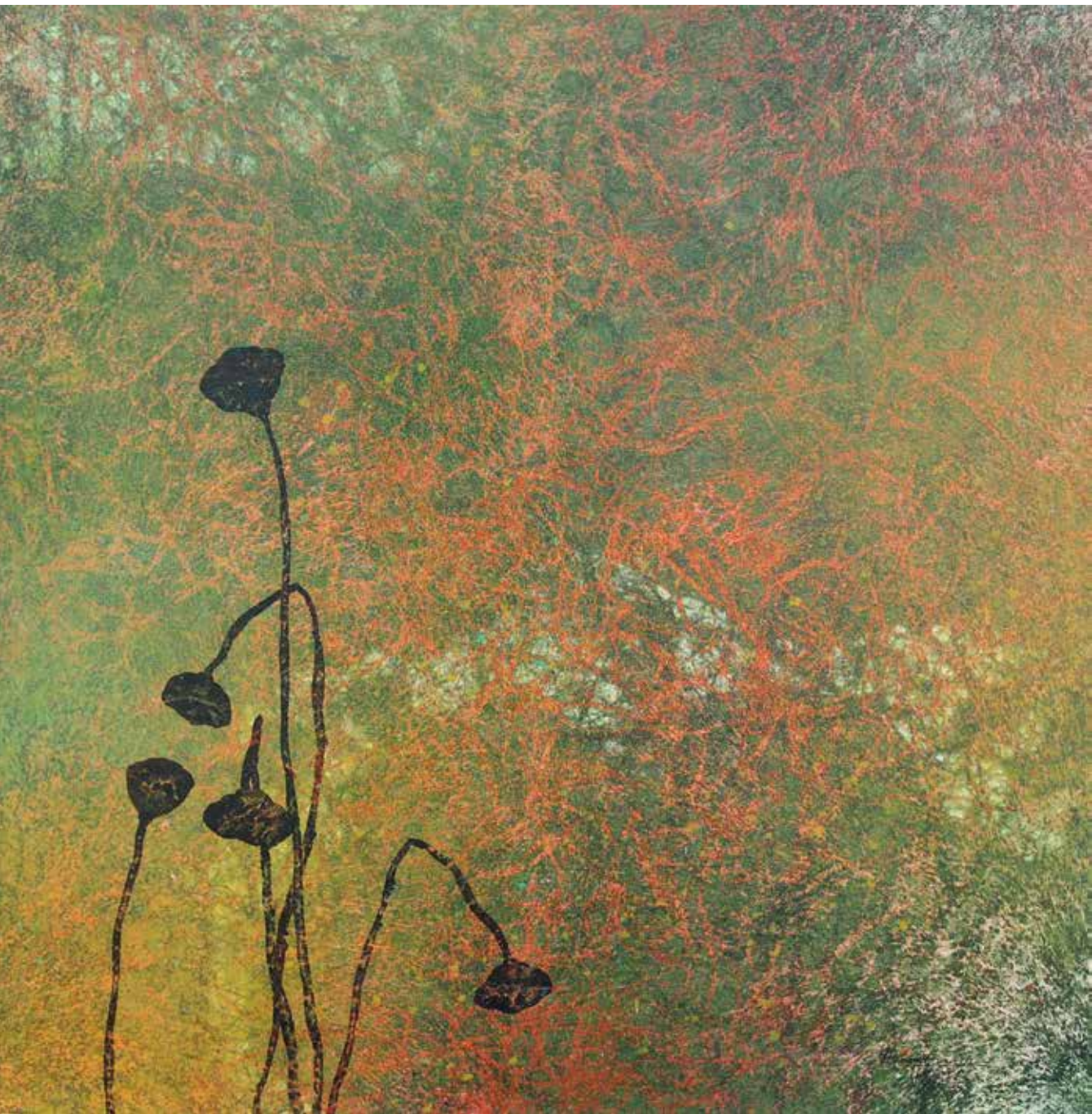
Lotus in Haze 荷非荷

Oil and Mixed Media on Canvas 麻布、油彩、綜合材料 138 cm x 138 cm 2012