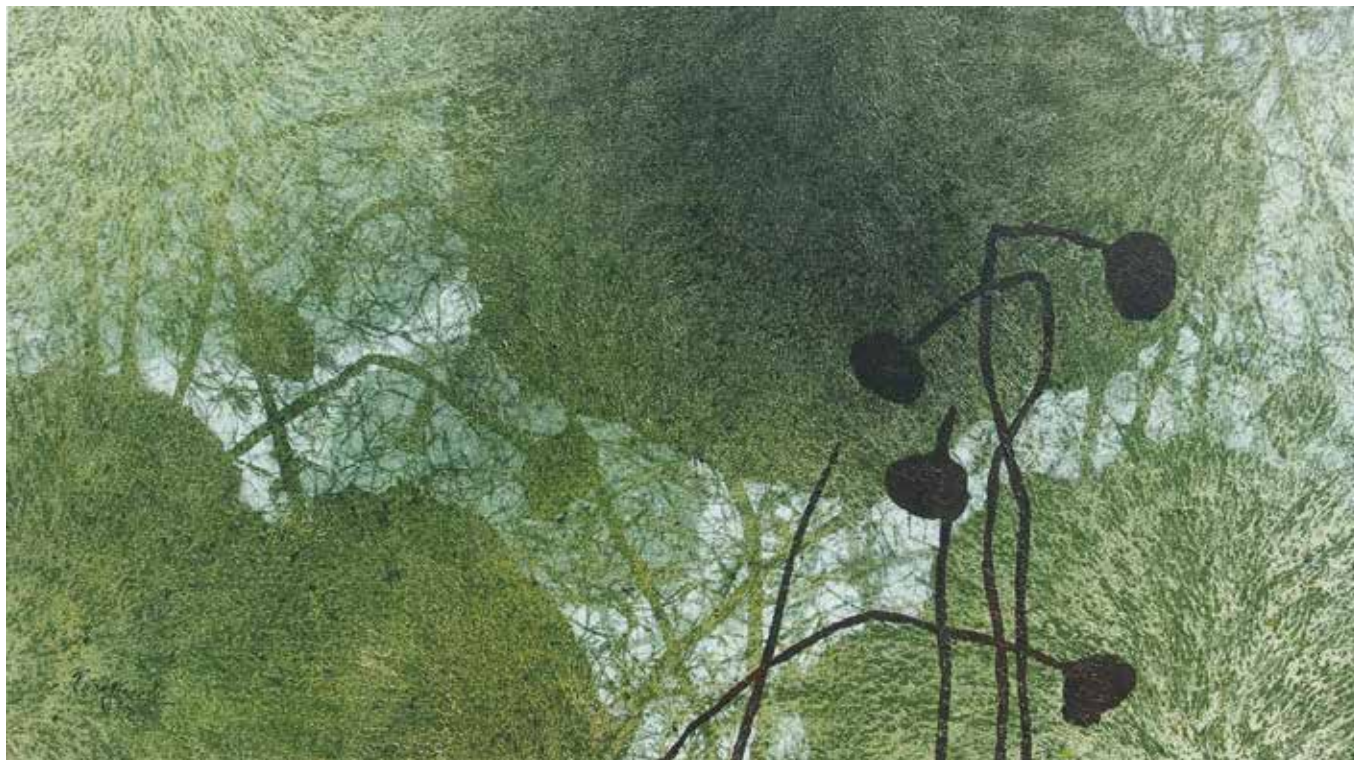
Lotus Glow 荷光

Oil and Mixed Media on Canvas 麻布、油彩、綜合材料 80cm x 140 cm 2013