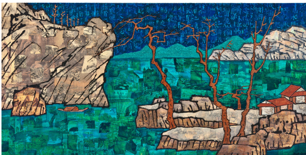
Xue Song, The Blue-green Landscape , 2018, Mixed media on canvas, 76 x 146cm