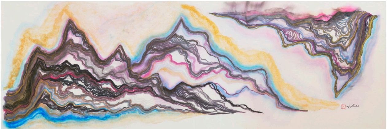
Victor Wong & A.I. Gemini, The Fauvist Dreams of Gemini 04 , 2020, Artificial Intelligence, Chinese Ink, acrylic & gold paint on rice paper, 43 x 124cm