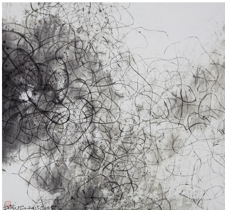
Wang Huangsheng, Moving Vision 150405 , 2015, Ink on paper