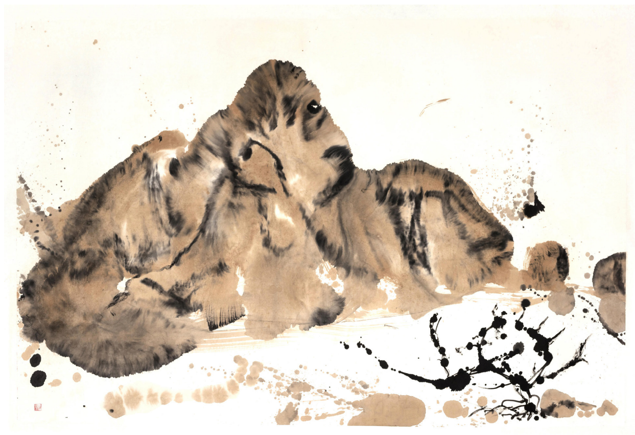
Chloe Ho, Tiger Mountain , 2016, Chinese ink and coffee on rice paper