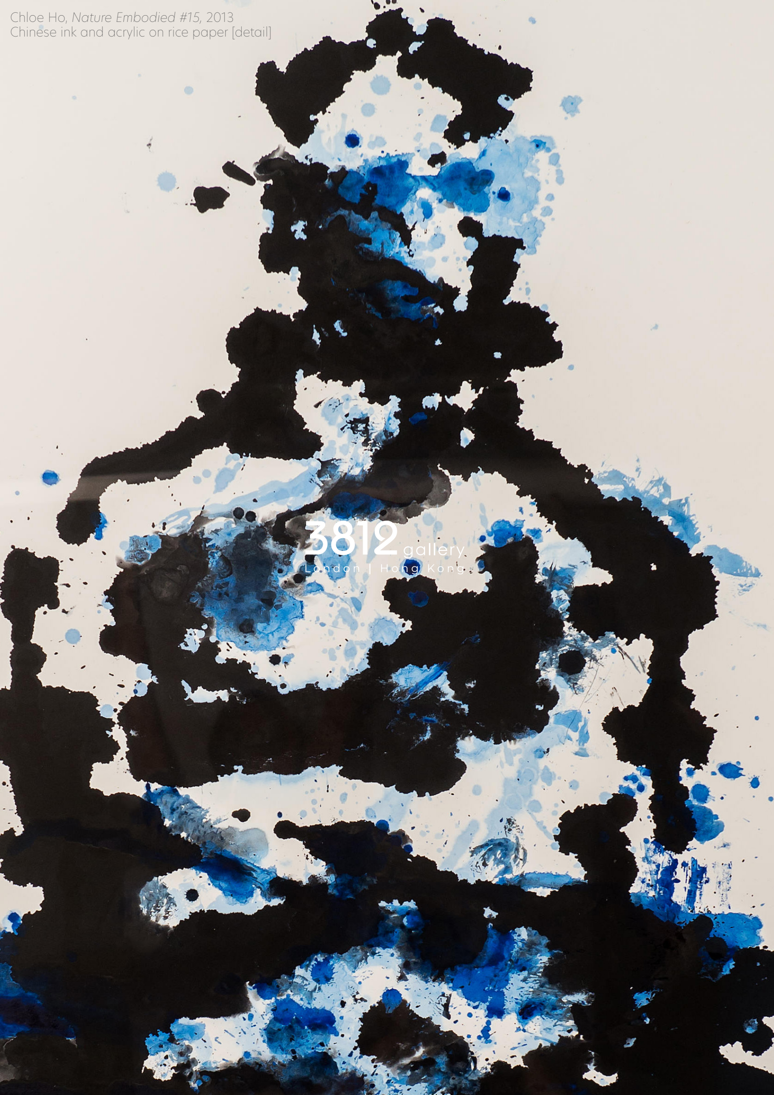
Chloe Ho, Nature Embodied #15 , 2013 Chinese ink and acrylic on rice paper [detail]