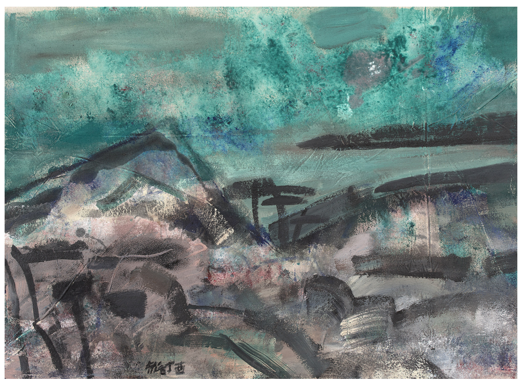
Wang Jieyin, Green Skies, 2017, Acrylic on canvas