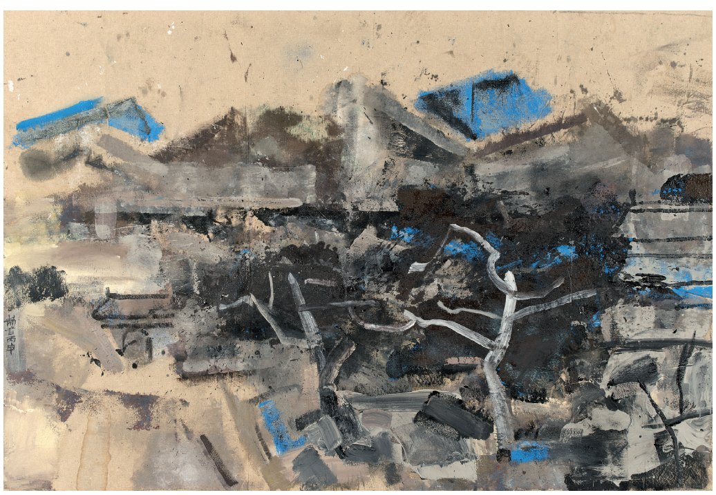
Wang Jieyin, Dwelling 1, 2017, Acrylic on canvas

Wang Jieyin's works have been exhibited around the world, and collected by important institutions such as Musee de Gravelines (Gravelines), Bibliothèque nationale de France (Paris), USC Pacific Asia Museum (Pasadena), Portland Art Museum (Portland), National Art Museum of China (Beijing), Long Museum (Shanghai), MGM Chairman's Collection (Macau) etc.