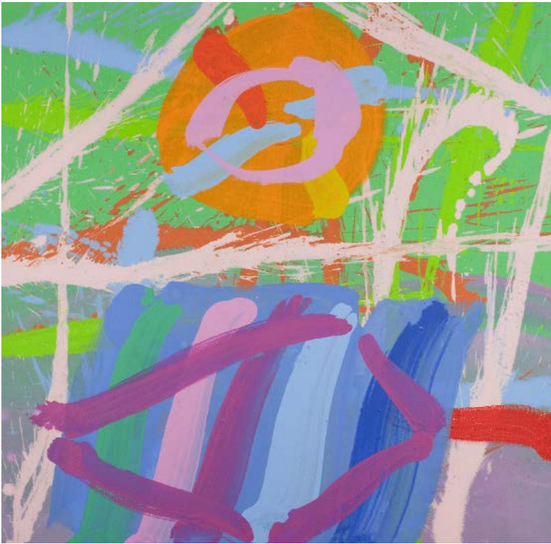
Albert Irvin, Hither II , 2007, Acrylic on canvas, 63 x 62cm

Irvin joined Gimpel Fils in 1982 they had regular, solo exhibitions of his work throughout his life.