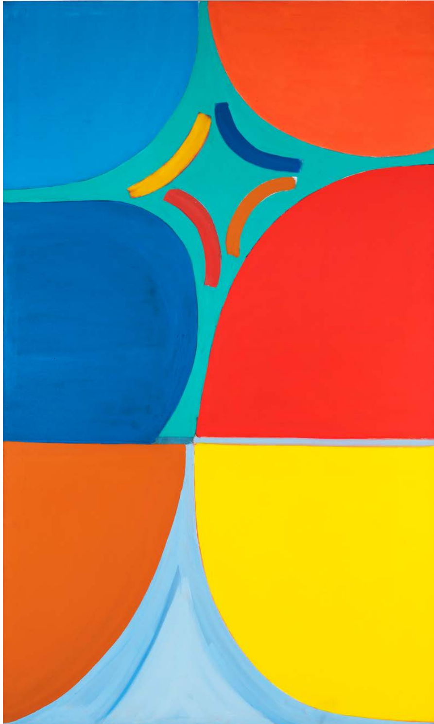
Terry Frost, June 68 , 1967-1968, Oil on canvas, 254 x 152.4cm