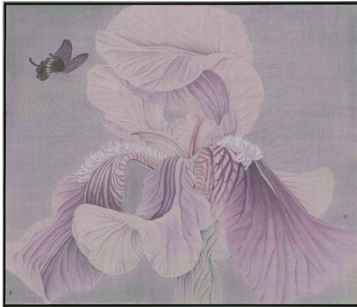
Yang Yanling, Jia , 2021, Ink and colour on silk, 110 x 130 cm