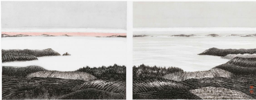
Kassia Ko 高杏娟, Parallel Series #1 《平行系列 #1》, 2022, Ink and colour on paper 水墨設色紙本, 36 x 94cm_LR