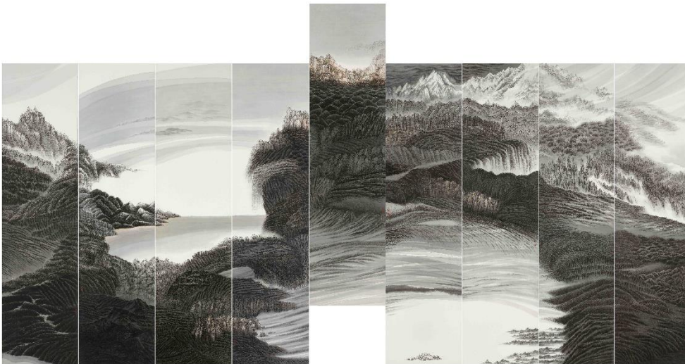
Kassia Ko 高杏娟 North Western Landscape 《西北山水》, 2021 Ink and colour on paper 水墨設色紙本 180 x 50cm (x9)

Click here to view more artwork images of Kassia.