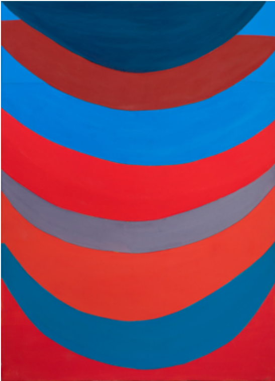
TERRY FROST Suspended Forms 1967, Acrylic and collage on canvas 183 x 1cm

In recent years, we have been reminded of the importance of the natural world; during the pandemic, many found respite and tranquillity in outdoor locations and cultivated renewed relationships with their local landscapes. Simultaneously, our planet's well-being is becoming increasingly precarious. The relationship between humanity and nature is thus complex, fluctuating between appreciation and destruction. Through the works on show, we are presented with a vision of landscape as a source of inspiration, ineffable beauty and reminded of its eternal value.