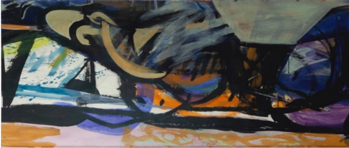
PETER LANYON Headwater 1962 Gouache on paper 104 x 244cm (Artwork Size) 125.7 x 270.5 x 3.5cm (Framed Size)