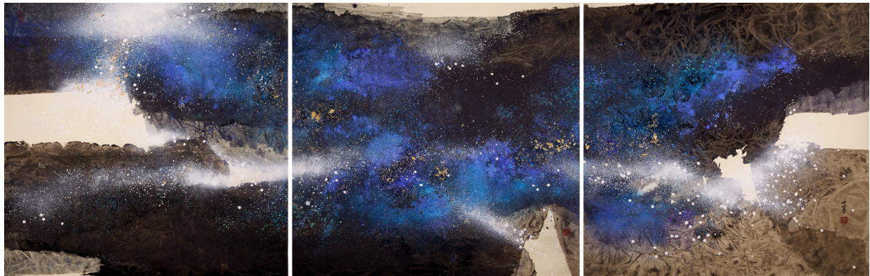
Raymond Fung, Breathing (23), 2020, Ink and colour on paper, 90 x 90cm (x3)

3812 Gallery is delighted to present the first ever solo exhibition of Raymond Fung's contemporary ink landscapes in Europe. On show will be his newest series Breathing and Life, debuting in London from 2 November to 7 January 2022.