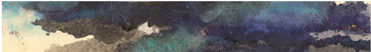
Raymond Fung, Breathing (16), 2020, Ink and colour on paper, 26 x 180cm