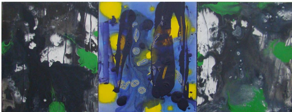
Autumn Water 9, 8, 10 Acrylic on canvas, 70x60cm (3 pieces), 2015