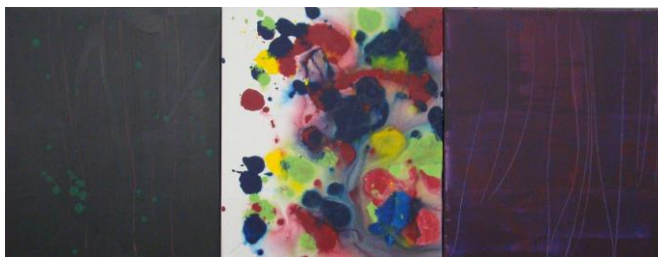
Etude1-Blossom in Spring 5-Etude2 Acrylic on canvas 70x60cm (3 pieces) 2018