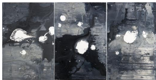
Recuperating Tranquility-11 Acrylic on canvas 150x100cm (3 pieces) 2019