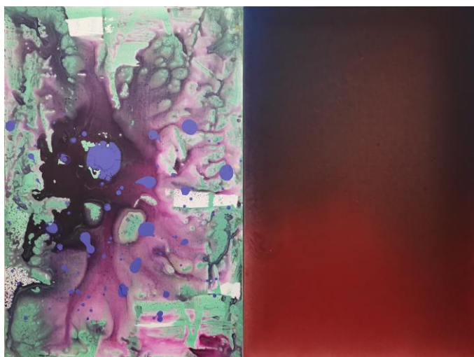
Calm Contemplation 29 - Between Clouds and Water 3 Acrylic on canvas, 150x100cm (2 pieces), 2015-2019